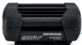
36V 4.0Ah DP3640XA