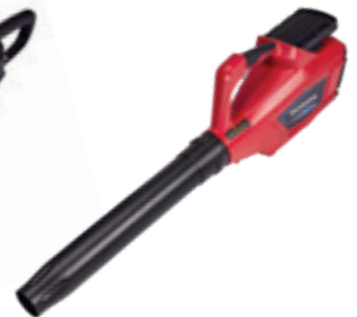
10 LEAF BLOWER