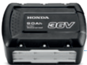
36V 9.0Ah DPW3690XA