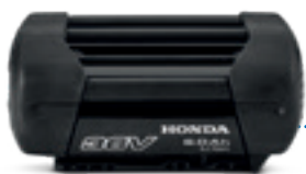
36V 6.0Ah DP3660XA